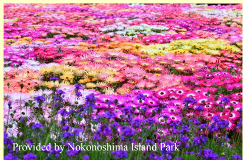
Provided by Nokonoshima Island Park

At Nokonoshima Island Park you can find different flowers during each season, but the Livingstone Daisy (in bloom from early April to early May) is one highly recommend. Originally from South Africa, 30,000 flowers bloom in a wide array of colors—a spread of white, yellow, pink, and orange across the island's slope overseeing the Genkai-nada Sea. Livingstone daisies have the unique property of opening up in the presence of sunlight, and closing at night or on rainy days, so we advise anyone interested to go on a nice and sunny day. Aside from the daisies, the poppies, azaleas, and marigolds are also quite beautiful.