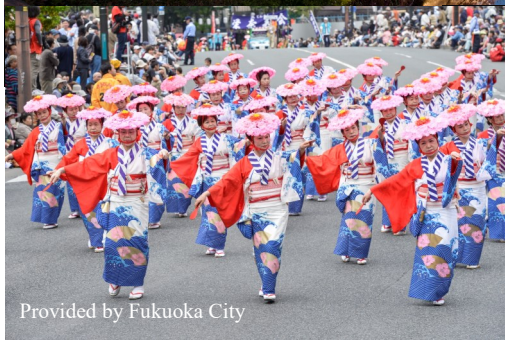
Provided by Fukuoka City