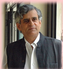
Grand Prize: Palagummi Sainath (India/ Journalist)